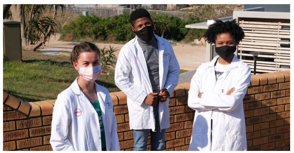
Nelson Mandela University Medical School students on the Missionvale Campus.

"It's been fantastic overall, and a lot of fun, but oftentimes daunting with all the responsibilities