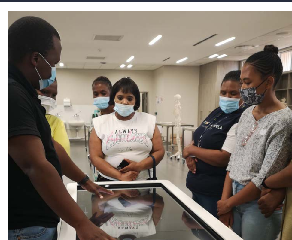
The Anatomage Table is among the technology at the Medical Scholl that allows users to visualise anatomy exactly as they would on a fresh cadaver

She also highlighted the "exciting challenge"