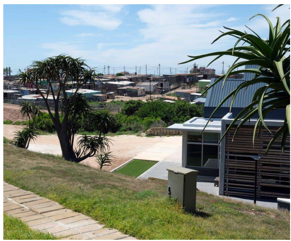
The Medical School is deliberately positioned on the University's Missionvale Campus to better serve the community

The city's northern areas lie slightly west, while New Brighton, KwaDwesi, KwaMagxaki and other