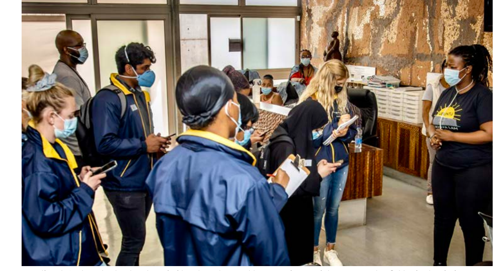
Medical School students visit Ubuntu Pathways in Zwide as part of their training

The class of 50 medical students visited the surrounding areas of Missionvale, Govan Mbeki, Zwide, Chatty, Gelvandale and West End, as well as clinics, the NGO Ubuntu Pathways and Missionvale Care Centre.