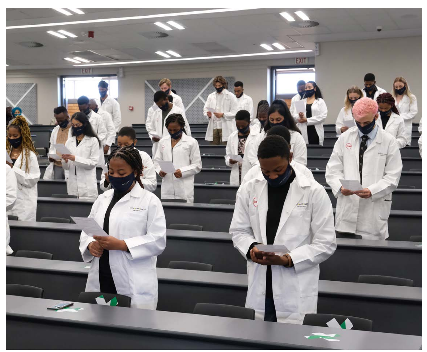
Medical School students pledge an oath to do what is morally right in their duty of care to patients and society

"Pedagogically, our approach is the training of future doctors as part of collaborative teams with other healthcare professionals and drawing on trans-disciplinary insights. Our teaching, learning and community practice model is firmly rooted in a holistic, bio-psycho-social approach to health and wellbeing — in which individuals are seen in the context of families and communities, inclusive of their rich and diverse cultural, social and linguistic bonds and traditions.