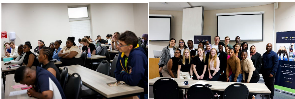
Above: Department of Human Movement Sciences student and staff during Undergraduate research showcase

Each research project showcased the dedication, innovation, and passion of our students with insights that could make a significant and deeper understanding of human movement, health, and wellness.