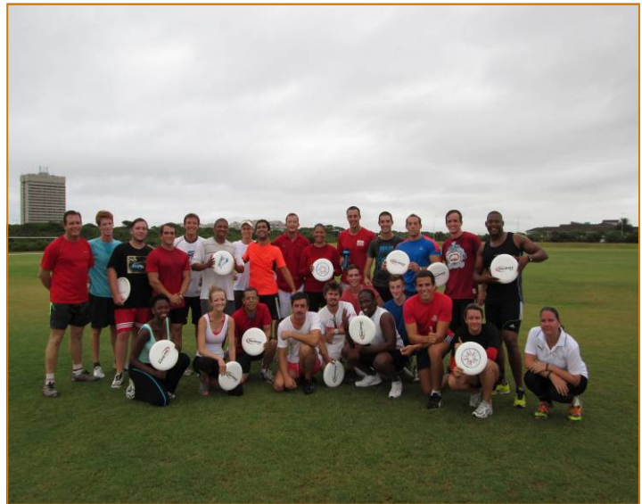
Above: First year EMC students participating in Practical Training

This is however just the beginning. Over the next few years, the Faculty will be introducing a large number of new qualifications as well as a much anticipated Medical School.