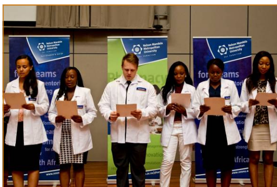
Above: Pharmacy students reciting the Pharmacist Oath

Thanks to a great effort from staff and sponsors we enjoyed a successful event that will be sure to continue as a tradition for many years to come.