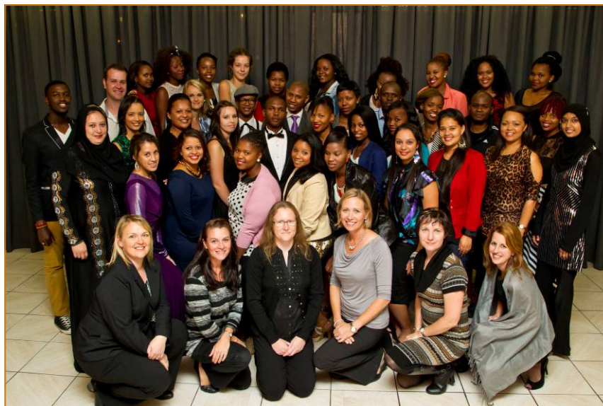
Above: The graduating class along with the pharmacy staff who supported and lectured them in 2013

This year the Pharmacy Department celebrated the first ever graduation of Pharmacy Technical Assistants in South Africa. A graduation dinner and award ceremony was held for the graduating class on the 16 th April 2014 at the North Campus conference centre. The evening was made possible through funding from the US President's Emergency Plan for AIDS Relief (PEPFAR) and CDC/South Africa, managed by the American International Health Alliance's HIV/AIDS Twinning Center.