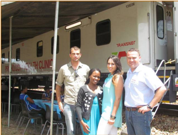
Above: Some of the Psychology students assisting on the Phelophepa train

The Phelophepa (pronounced pay-lo-pe-pa) train, also known as the mobile hospital, provides the underprivileged population with the highest quality care and education.