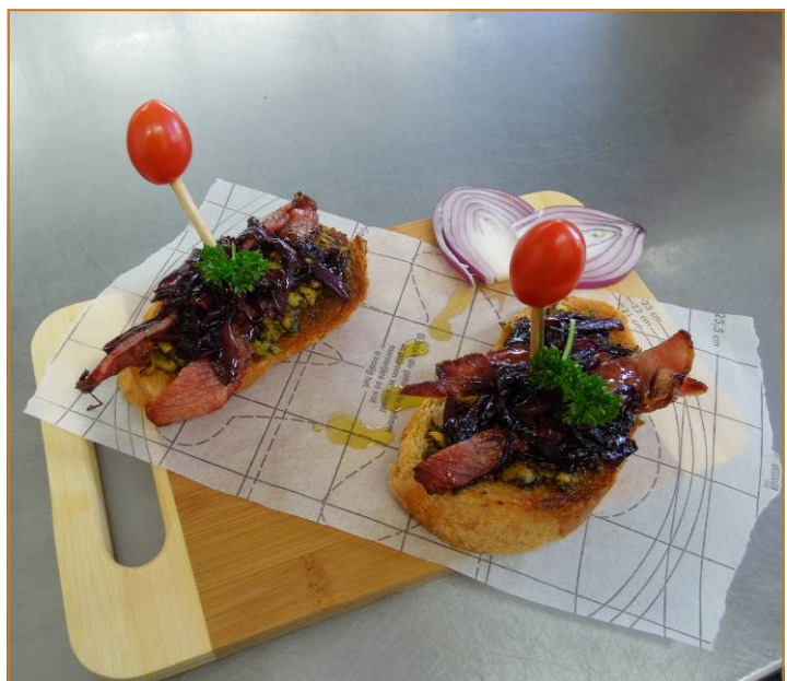
Above: "The Hearty Hamburger", as presented in a Dietetics practical test